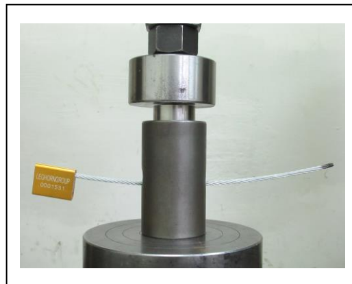
Shear Set up

SAFETY PRECAUTIONS - Do not exceed a shear force greater than 8900N(2001lbf) .If the specimen has not failed at that force, halt the test and unload the test equipment. Record a shear force of 8896N (2000 lbf).Sudden and violent rupture of the test specimen can endanger personnel, equipment and property.