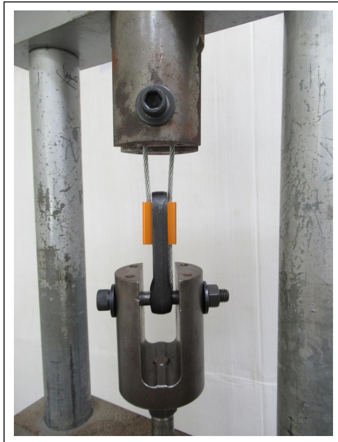
Impact Set up

TEST REPORT NO. : K0518122-T01 Page 8 of 9